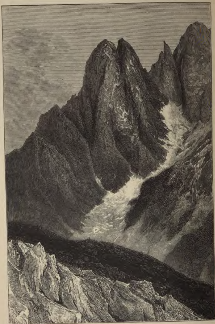
THE AIGUILLE DU DRU FROM THE SOUTH